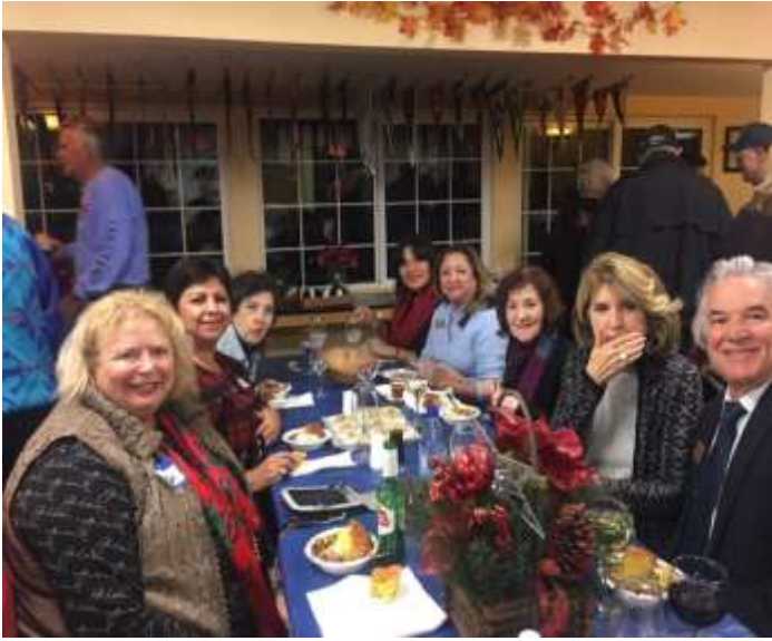
Members & guests & warm chili!