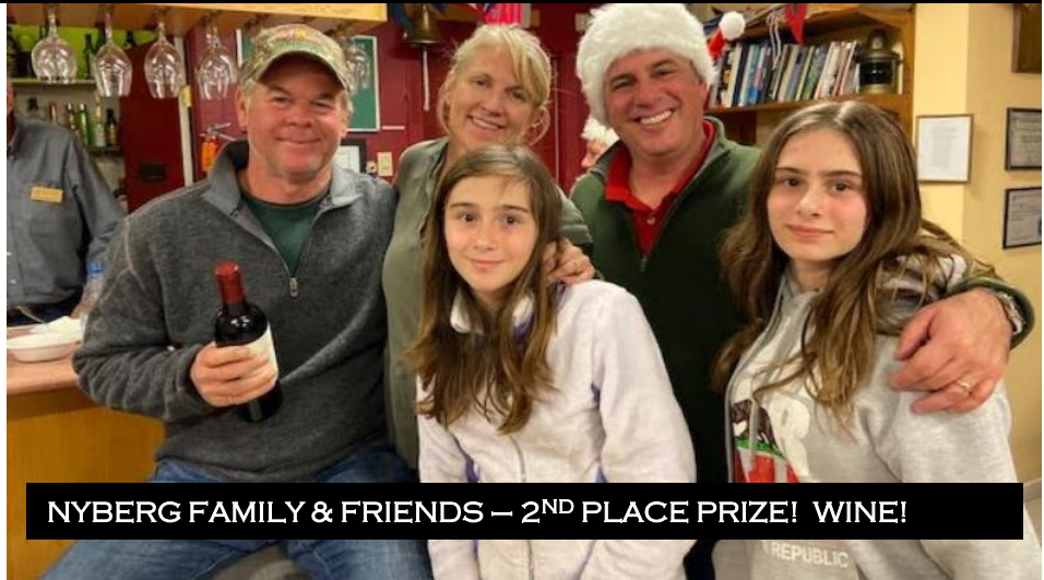
NYBERG FAMILY & FRIENDS – 2 ND PLACE PRIZE! WINE!