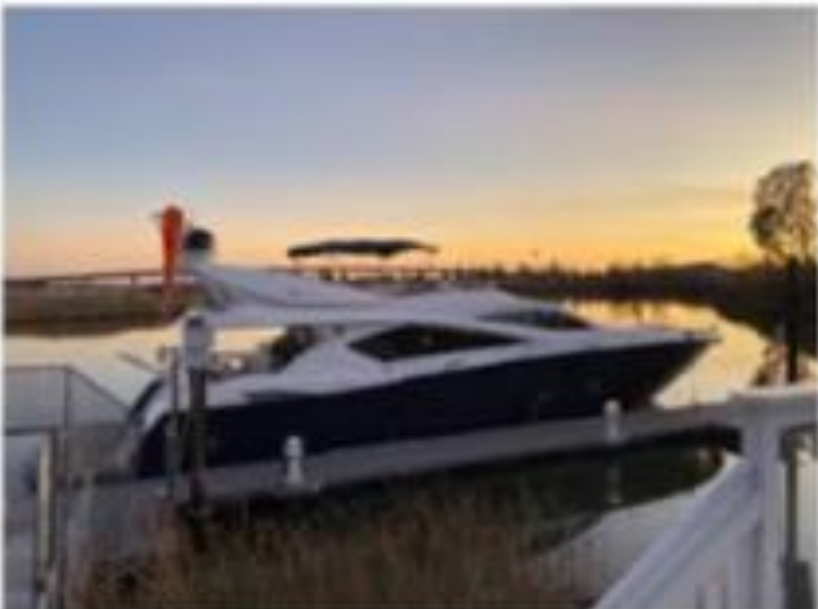
CRUISE IN GUEST – BEAUTIFUL 82FT. YACHT