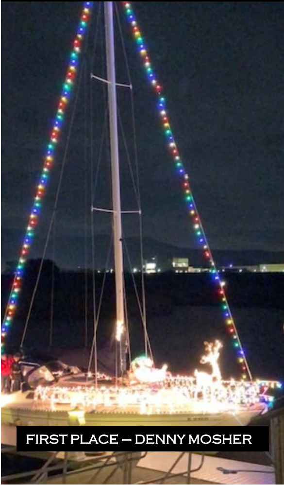
FIRST PLACE – DENNY MOSHER