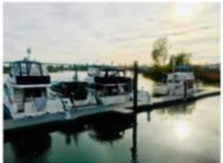
BENECIA CRUISE IN NOVEMBER 2019