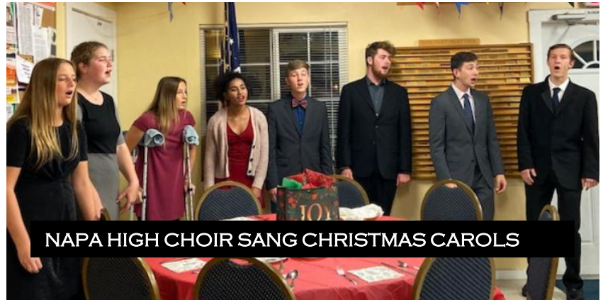
NAPA HIGH CHOIR SANG CHRISTMAS CAROLS