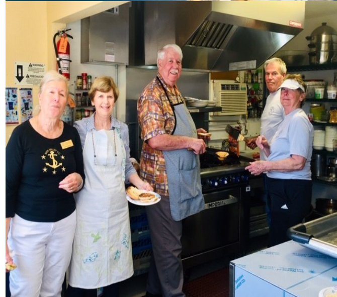
Glen Cove YC