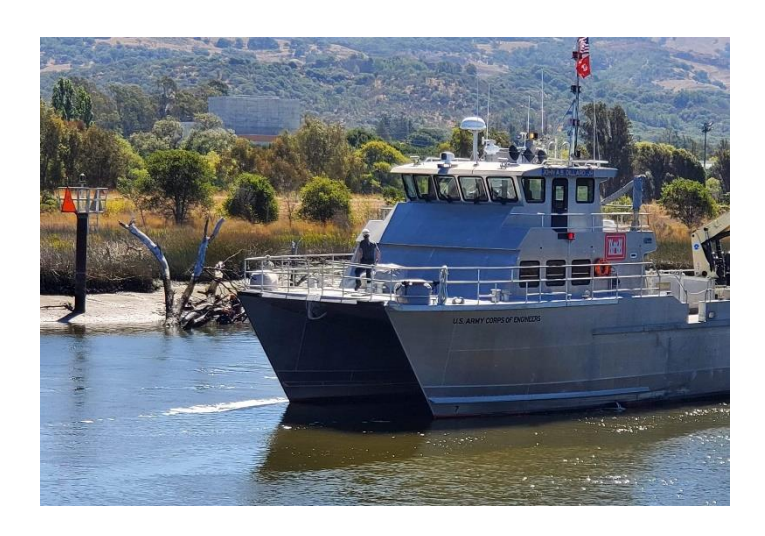
The Napa River dredging project has begun This Army Corp of Engineers vessel is the first boat to arrive and start clearing the water of debris, such as the large tree on the river bank. If you look closely there are 2 men in the water with chainsaws. Once cut to size the tree will be lifted topside to the deck of the vessel and taken away.