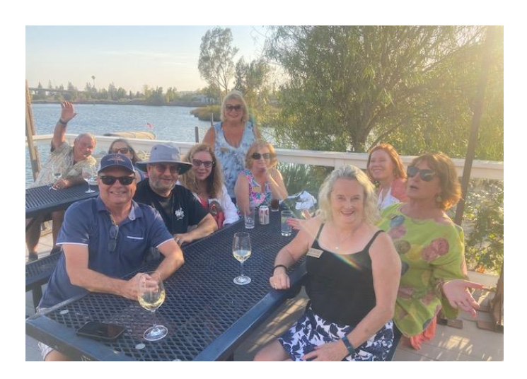
Drinks and appetizers at the NVYC with cruisers on Sept. 9