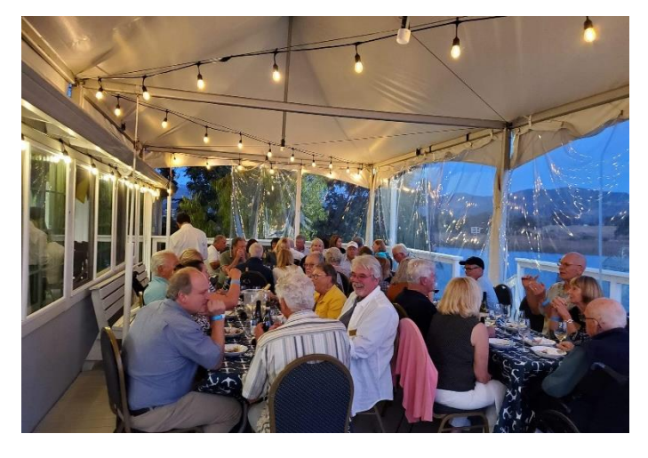
Summer Friday night dinners have continued in popularity. Tent seats have been going fast!