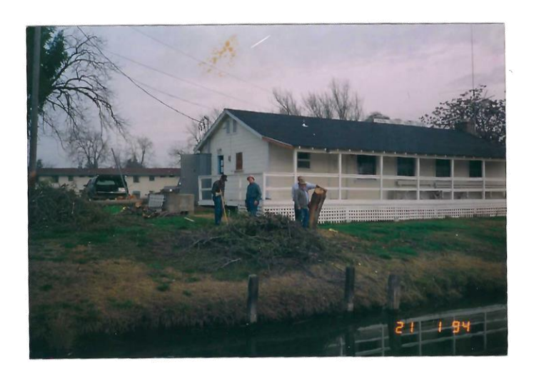
The exterior of the Napa Valley Yacht Club, circa 1994.