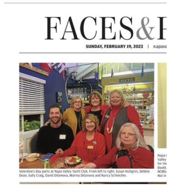
The Napa Valley Register even featured our event!