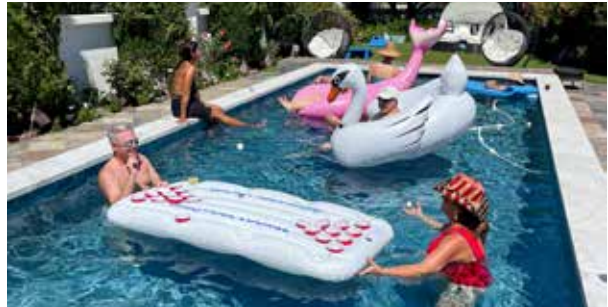
A serious game of pool beer pong