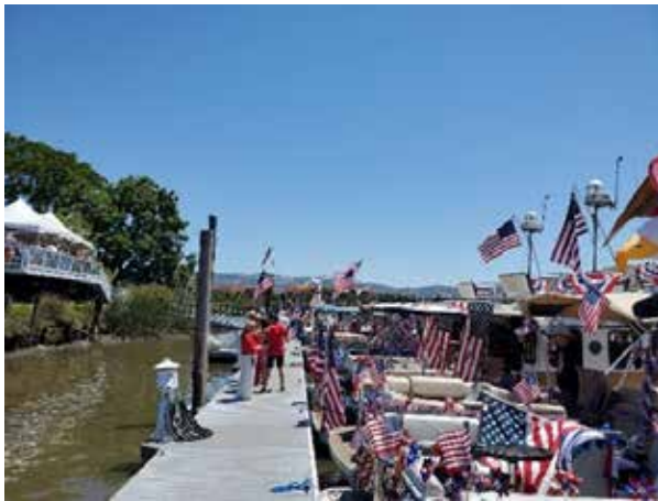
A full dock of decorated boats

We then rushed back to the club where we joined a dozen boats all decorated for July 4th with Flags, eagles, and a swan for some reason!