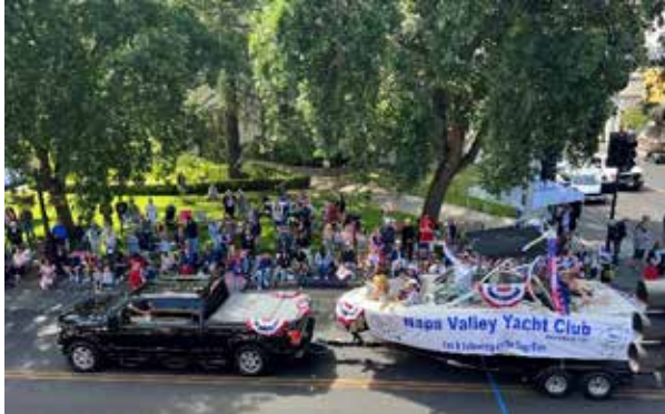
The NVYC 'Float' for the Downtown Napa July 4 Parade