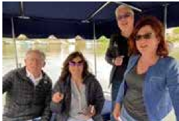
Club members on the Scavenger Hunt

Friday dinners, under the new model are working out well. We have had some rave reviews about a few of the restaurants we are using. And folks clearly love the Pot Lucks and Burn Bring Your Own Meat Night. We are keeping a constant eye on food quality and options and prices ensuring that we have a great variety of food at a wide range of prices to keep the club open to all.