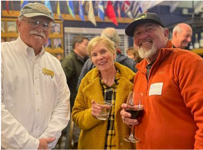
Another enjoyable evening at the Club