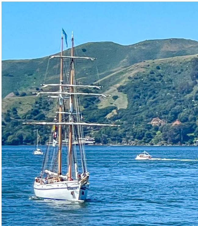
Opening Day on the Bay 2023

If anyone would like to join me at these events let me know. It’s normally $25. - $35.