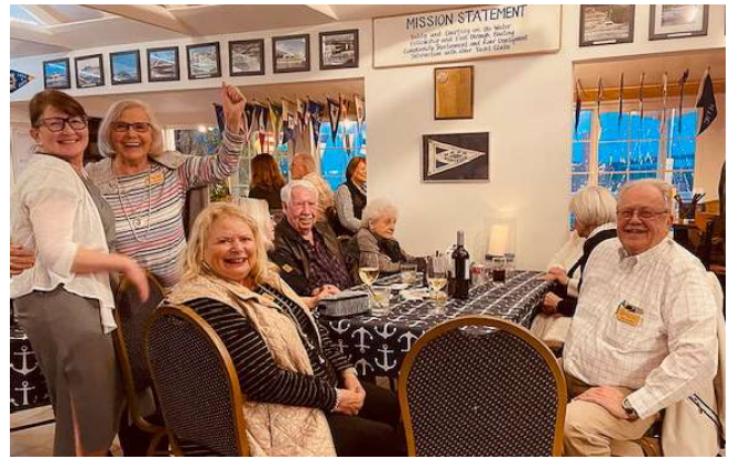
Fun evening at the Clubhouse

We have added a few new spirits to the back bar and have changed a couple well spirits to improve our selections so you can always find the beverages you like at the club. We will be changing up wine selections in the coming months to provide the best wines available and keep options fresh going into the warmer weather and longer days. Be on the lookout for some drinks specials on holidays and themed Fridays!