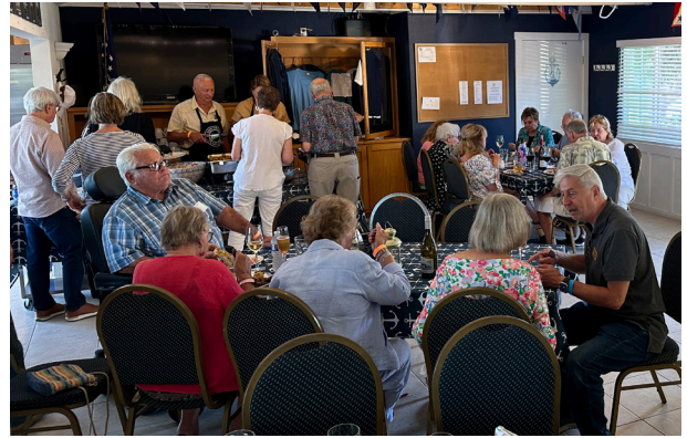
Fun evening at the Clubhouse