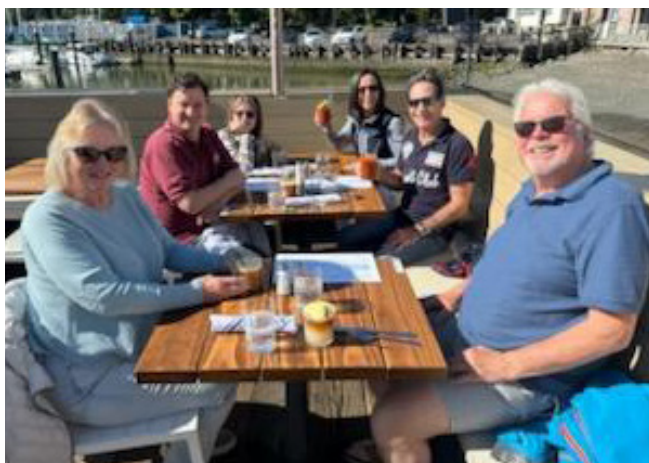
Relaxing at the Angel Island Cafe terrace

Several members cruised out to Angel Island earlier this Spring!