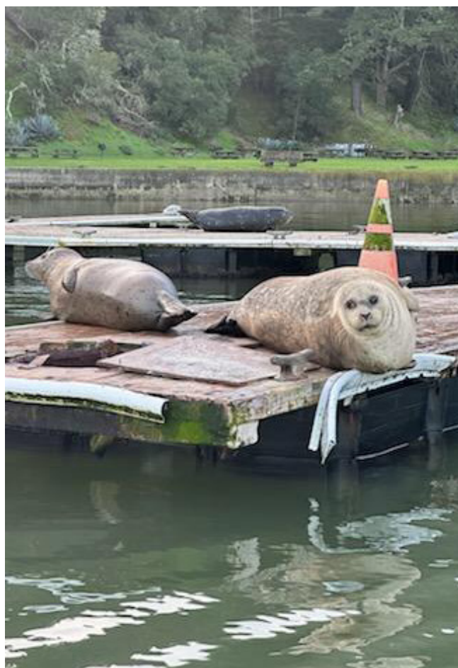
These harbor seals are cute, but they've done lots of damage to the Angel Island Marina