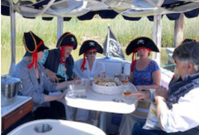
Slow Dance was commandeered for the Day!

We opened the season on the river on May 10 with a parade to downtown Napa!