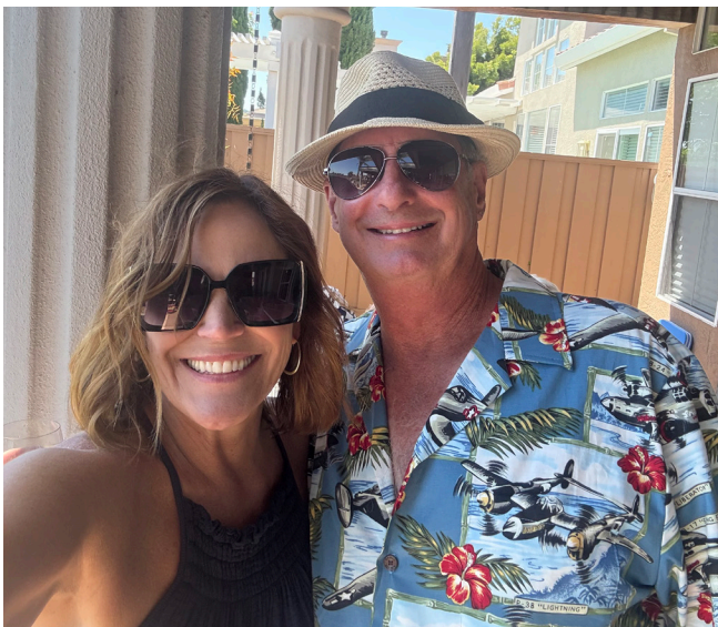
Maragarita party Cornhole Champs for 2025!