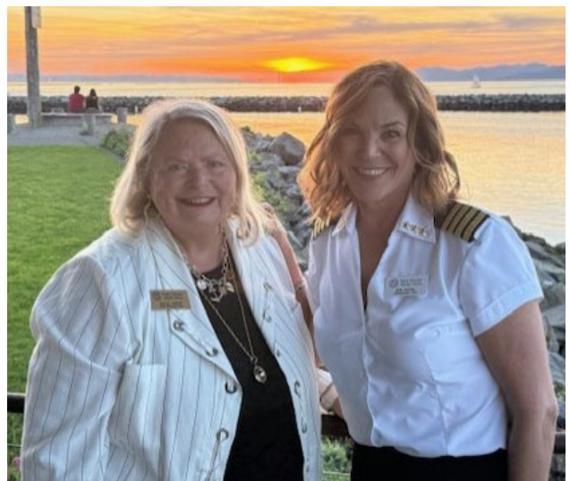
A perfect sunset to close out 2025