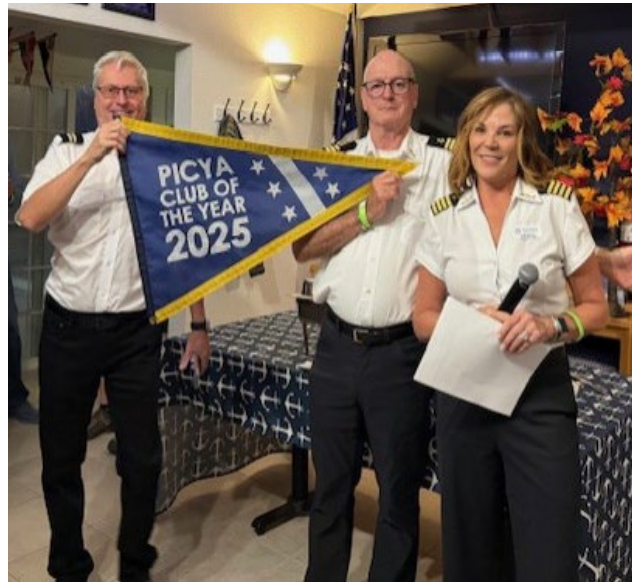
Your 2025 Leadership Team